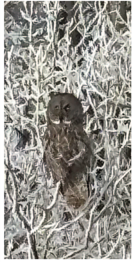
Great grey owl by Charlie Powell