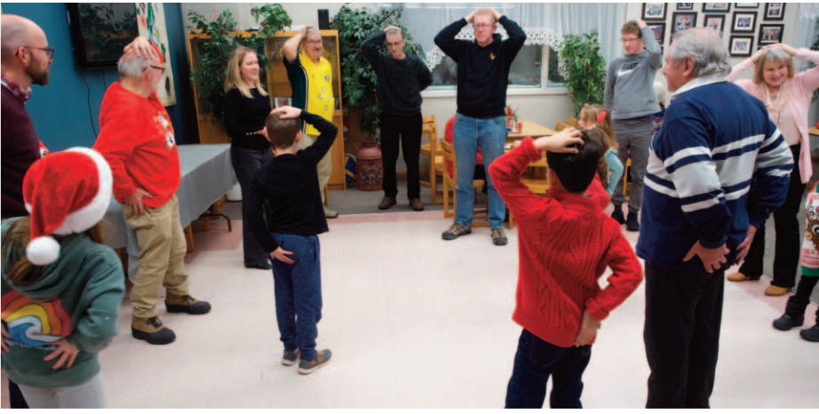
A classic game of 'two-up' at the Christmas Party gets everyone involved.