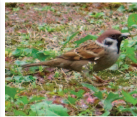
Eurasian tree sparrow