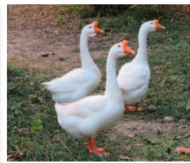
White Chinese goose (knob-head)