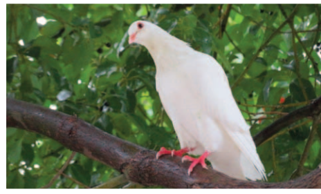
White rock pigeon

Below are some Canadian west coast gulls and herons photographed this autumn on Bowen Island by Brian Hydesmith.