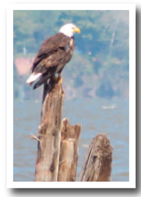
Bald eagle.

Like you, I have often seen eagles. Usually they are high in the sky or caged in a zoo. The photo above was a privileged opportunity to be that close to a magnificent golden eagle. A recent sighting was in early May, while driving north of Winnipeg. A bald eagle had just taken an unlucky rodent or rabbit and was flying to a nearby hydro pole to enjoy its breakfast. And the photo below was taken this month, using maximum zoom, on Lake Superior, Wisconsin.