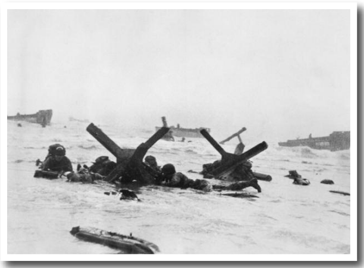
Photographer Robert Capa's famous image of American troops on Omaha Beach during the Normandy D-Day landings on 6 June 1944

About a dozen Australian soldiers were attached to British army formations, learning the ropes in preparation for amphibious operations in the Pacific later in the war. Some 500 Australian sailors served in dozens of Royal Navy warships, from battleships and corvettes down to motor torpedo boats and landing craft. Several Australians commanded flotillas of tank-landing ships, while others piloted landing craft carrying British and Canadian infantry onto the beaches.