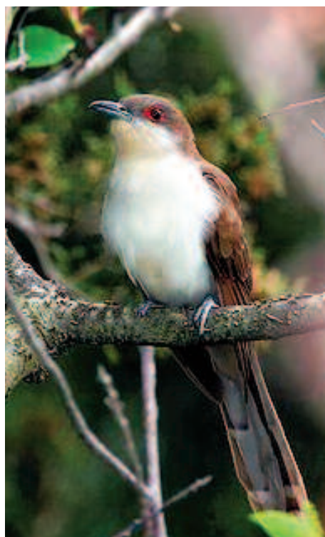
Black-billed cuckoo by Wolfgang Wander (colors adjusted by Skiessi) - [link], CC BY-SA 2.5, [link]

er with the captured hairs, as a pellet. Their diet also includes insects, berries, snails and other birds' eggs. This species is more likely to incubate its own chicks (no currawongs in Manitoba).