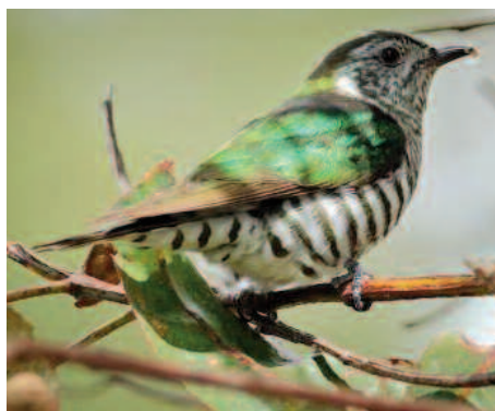
Shining cuckoo (aka shining bronze-cuckoo) [link]

I haven't seen one yet, but North America's black-billed cuckoo includes southern Manitoba in its range. That is good because they feed on grubs that other birds are not so keen on, for example hairy caterpillars, like the tent caterpillar which can be so damaging to our forest canopies. Their tolerance for the unpalatable hairs is due to the ability to shed their stomach lining and eject it, togeth-