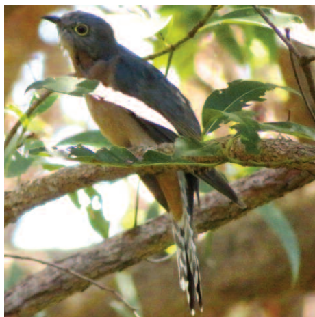
Fan-tailed cuckoo, Mt Coolum, Qld