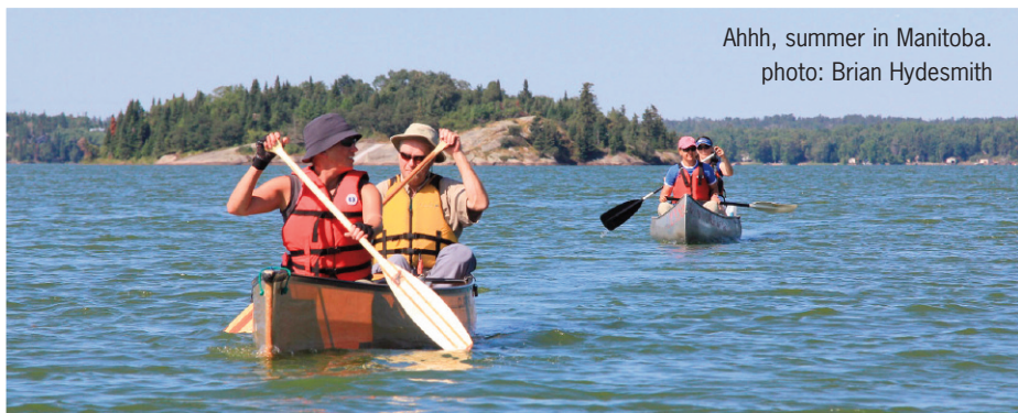
Ahhh, summer in Manitoba.

Have a enjoyable start to the summer and we'll see you out at our upcoming events