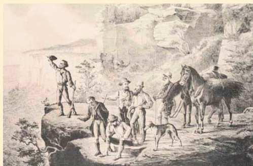
Blaxland, Lawson and Wentworth with their convict helpers, in an 1880 image depicting the expedition.

http://www.australiangeographic.com.au/journal/200-years-on-crossing-of-the-blue-mountains.htm