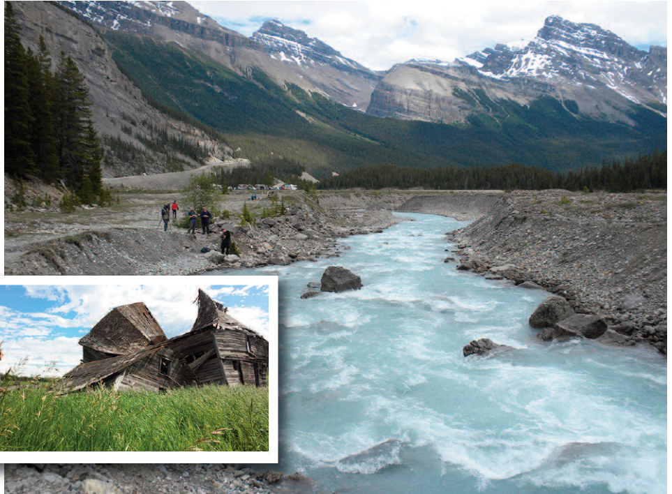
A western road trip provided ample options for great photos. See story page 4.

Let us know you are coming, RSVP to (Liz) social@downunderclub.mb.ca or 204-487-0067 or look for the new RSVP page under EVENTS on our website.