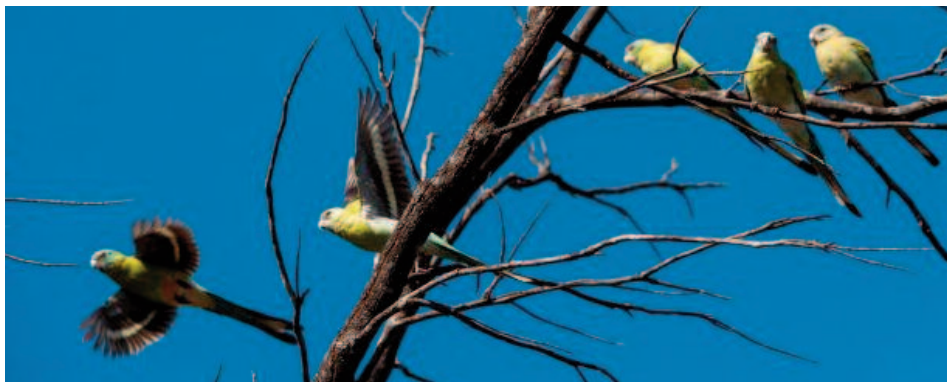
Juvenile golden-shouldered parrots.