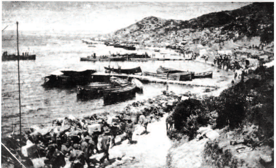
Anzac Cove as it looked 100 years ago when the troops landed. The Down Under Club will hold a major event on April 25th at Winnipeg's aviation museum. We expect to see you there!

Individual $20 ... Couple/family $30 ... This is the last chance to renew your membership! If you haven't paid your dues yet for 2015, please go to the website link below and make it happen. It is super easy now with Pay Pal, or you can mail a cheque Or just bring the cash to the next event. Please call Norm Griffiths at 204-661-3873 to indicate your intentions. Phone Peter Debenham at 204-955-0393 for assistance, or email peter@pdilact.ca .