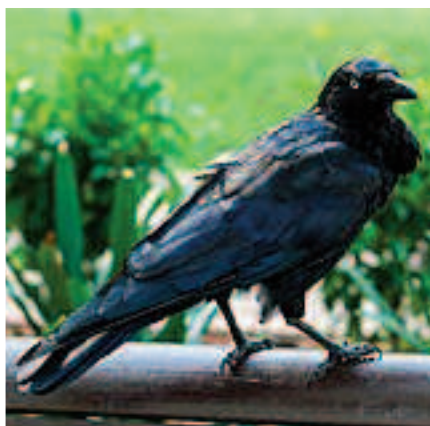
The most common 'crows' in Australia are C. coronoides , which is actually the Australian Raven and is distinguished by a white iris.

While their intelligence is admired, their appetite for other, smaller native birds has not