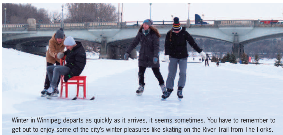
Winter in Winnipeg departs as quickly as it arrives, it seems sometimes. You have to remember to get out to enjoy some of the city's winter pleasures like skating on the River Trail from The Forks.