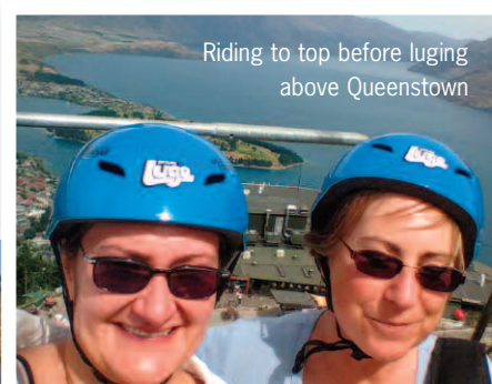
Riding to top before lugging above Queenstown