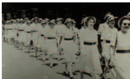
A group of Voluntary Aid Detachment (VAD) nurses marching along George Street after attending a Christmas service in the Cathedral

The primary role of a Voluntary Aid Detachment (VAD) member was that of nursing orderly in hospitals, carrying out menial but essential tasks - scrubbing floors, sweeping, dusting and cleaning bathrooms and other areas, dealing with bedpans, and washing patients. They were not employed in military hospitals, except as ward and pantry maids; rather, they worked in Red Cross convalescent and rest homes, canteens, and on troop trains.