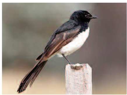
Check out Willie Wagtail and his local friend on page 6.