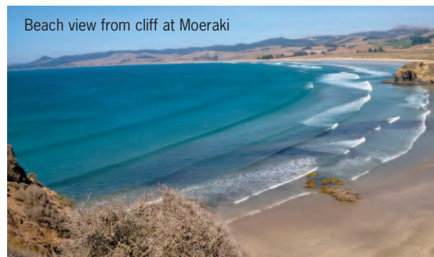
Beach view from cliff at Moeraki